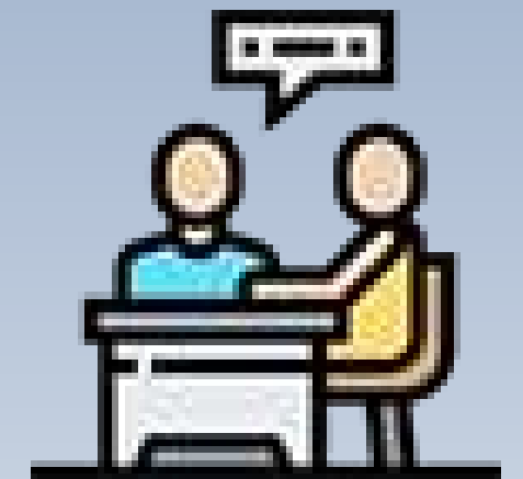
Consultancy & Advisory