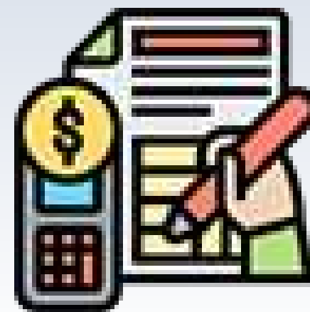
Book Keeping Services