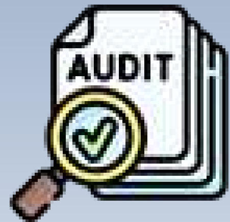
Audit & Assurance